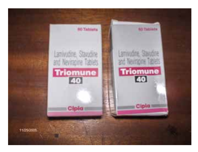
Comparision photos of legitimate drugs to their fake counterparts

AIDSfreeAFRICA has been working in Cameroon for the past 11 years. Recently, we have proposed to help with the task of analyzing a cross section of the existing drugs that are available in the country's pharmacies, hospitals, black market, and roadside shacks. It is difficult for the Cameroonian government to keep track and to know the exact conditions of the drugs, so they make assumptions based off of their origin. Just because a drug is from a trusted source doesn't mean that it will be viable by the time it reaches the patient. In Cameroon, each source of drugs serves a purpose and provides people of different economic backgrounds with the access to treatment. The question to be answered is: are the drugs a patient buys of high quality by the time they purchase them?